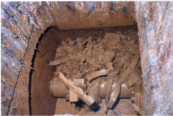
View into a running AVA 10 m3 mixer: Hazardous waste, during the mixing process after treatment by means of rotary cutter

The simultaneous mixing and buffering of an input quantity of up to two hours – based on the throughput performance of the incineration plant - means that one is also independent of, for example, operating errors and delays during the charging of the plant. This means that the incineration plant is able to run 24 hours a day at highest throughput performance and at highest efficiency. The actual homogenisation of the waste is achieved by means of a single shaft mixer which is equipped with an adjustable weir. Charging flanges on the mixer can be used to add liquid waste into the mixing process. The addition of nitrogen prevents the creation of an explosion-prone atmosphere, which is also continuously monitored for safety reasons.